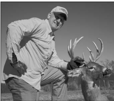
The General with a 5x5 Kansas Whitetail taken 12/5/06